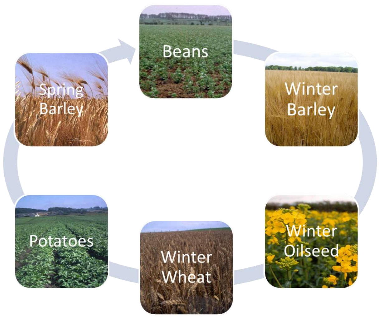
Illustration 1: Example of northern European crop rotation