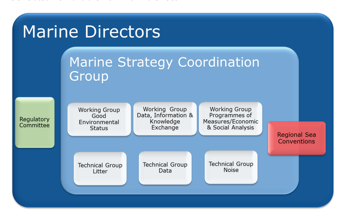
Figure 2: Organisational structure

All the groups need to collaborate, where appropriate, with the Regional Sea Conventions, and the timelines should, in as much as possible, be set up in such a way to facilitate exchange between the CIS-related work and the work within the RSCs.